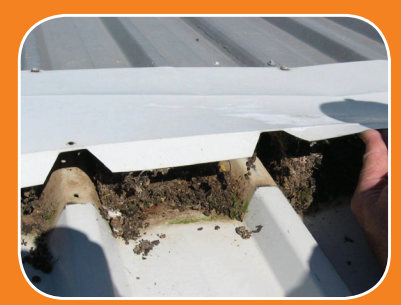
Ridge capping debris.