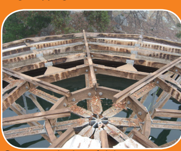
Centre pitched roof debris