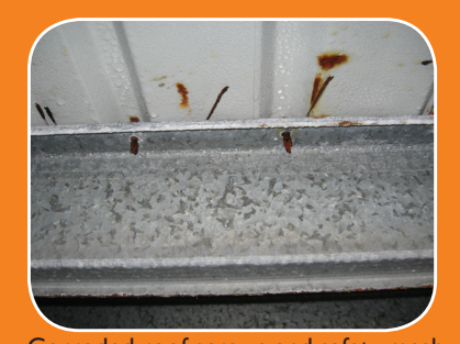
Corroded roof screws and safety mesh.