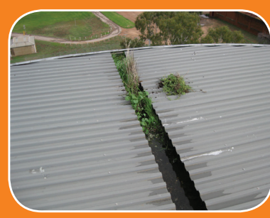
Box gutter blocked and overflowing.