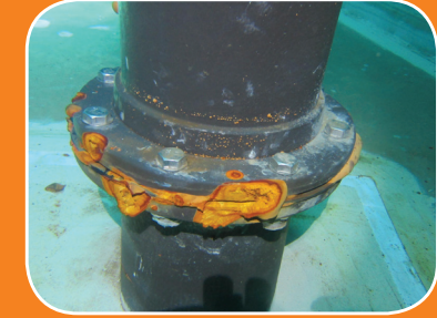
New ductile iron pipework corroding.