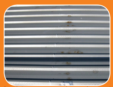
Roof sheet corrosion from safety mesh below.