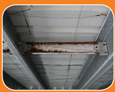
Corroded purlins and safety mesh.