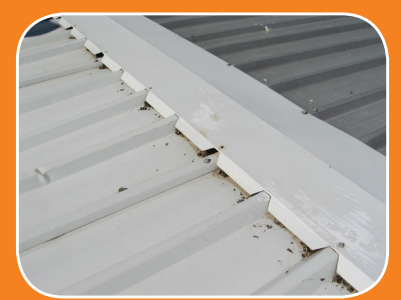
Ridge capping appears to be sealed.