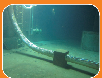
Pipe work should be under the floor.